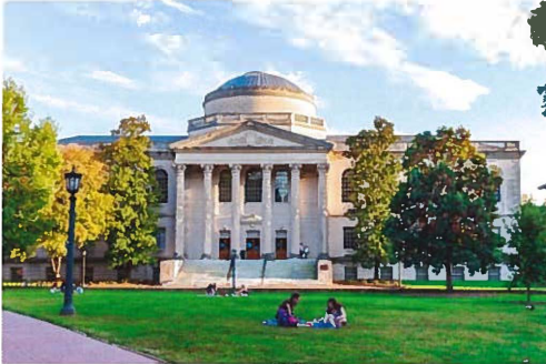
University of North Carolina

The Purpose of the Hagan International Scholarship is to provide recipients with the opportunity to attend graduate school at a U.S college or university. And, to provide recipients with a practical understanding of important life skills not typically covered in the school curriculum.