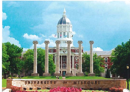
University of Missouri-Columbia