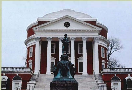
University of Virginia

“ You can’t go back and change the beginning, but you can start where you are and change the ending.” C.S. Lewis