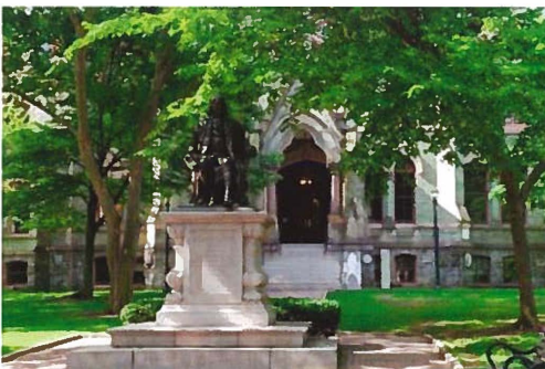
University of Pennsylvania

To be fair to all recipients we will not make exceptions to the Scholarship Criteria or Submittal Deadlines.